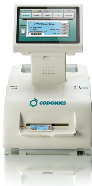
SLS Point of Care Station (PCS) identifies medications and prints barcoded medication labels

SLS barcoded medication labels enable integration with existing EMR and BCMA systems to enhance the safety and effectiveness of drug order verification at the bedside and beyond.